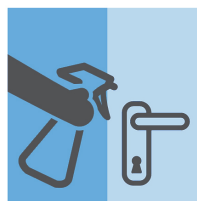
CLEAN AND DISINFECT "HIGH-TOUCH" SURFACES OFTEN