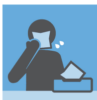
COVER YOUR MOUTH WITH A TISSUE OR SLEEVE WHEN COUGHING OR SNEEZING