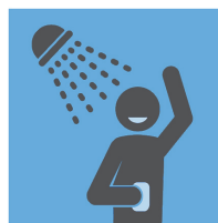
PRACTICE GOOD HYGIENE HABITS

For more information, visit: coronavirus.ohio.gov