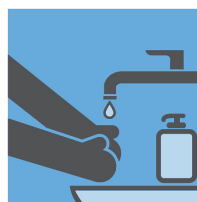
WASH HANDS OFTEN WITH WATER AND SOAP (20 SECONDS OR LONGER)