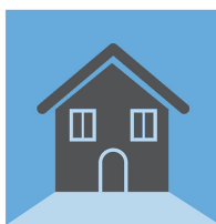
STAY HOME WHEN YOU ARE SICK

Cleaning tips from CDC: https://www.cdc.gov/coronavirus/2019-ncov/community/home/cleaning-disinfection.html