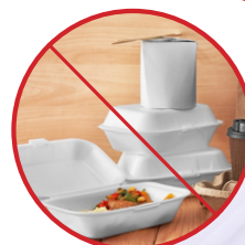
Foam sheets and food containers, even if they have never touched food.